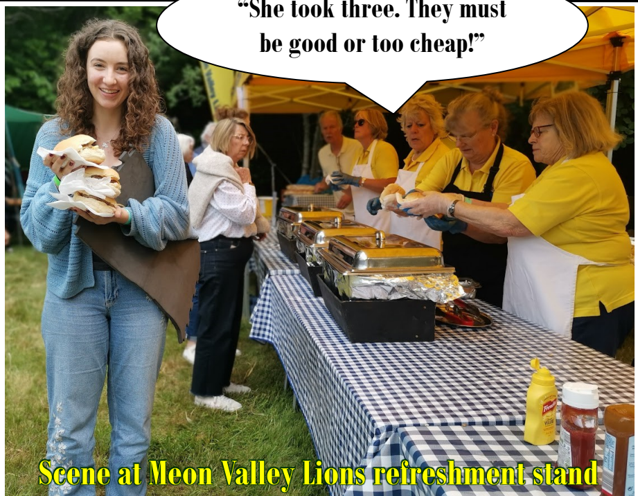
Scene at Meon Valley Lions refreshment stand