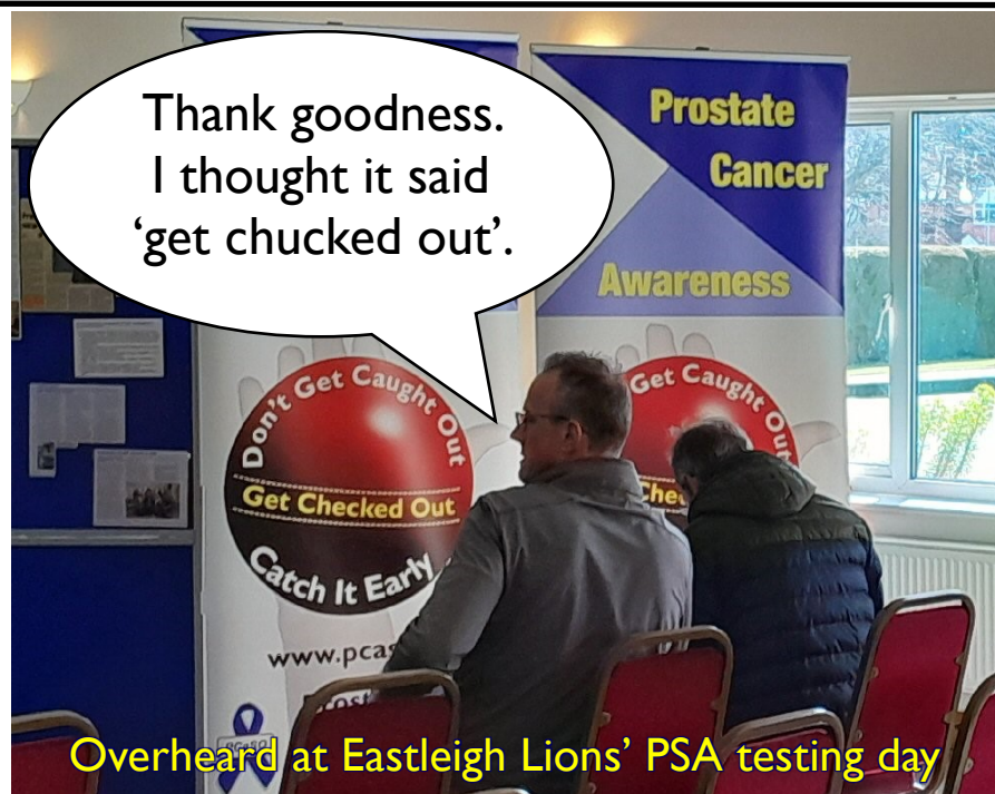
Overheard at Eastleigh Lions' PSA testing day