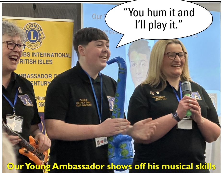
Our Young Ambassador shows off his musical skills