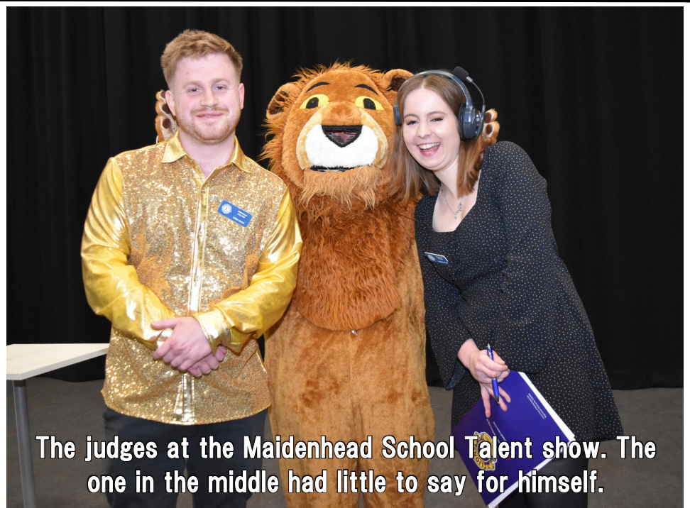
The judges at the Maidenhead School Talent show. The one in the middle had little to say for himself.