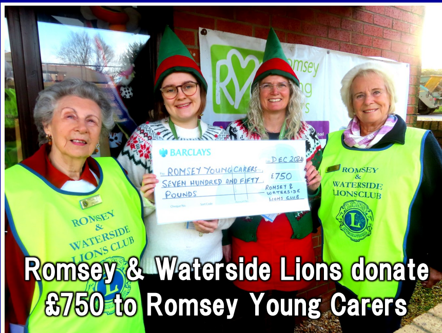
Romsey & Waterside Lions donate £750 to Romsey Young Carers

“The pen is only mightier than the sword if you are allowed to use the pen.” - Ambrose Bierce