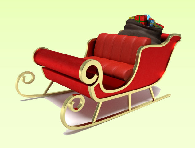
(A design for your joint sleigh, Judith)