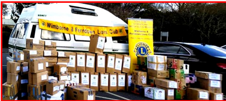
Collected glasses in boxes of 100 ready to be sent by the Wimborne and Ferndown Lions for processing.

As we grow older, many things can happen to our bodies. There is one thing that changes for nearly everyone and that is their eyesight. If that happens to you, unless you go in for contact lenses, it means a new pair of specs.