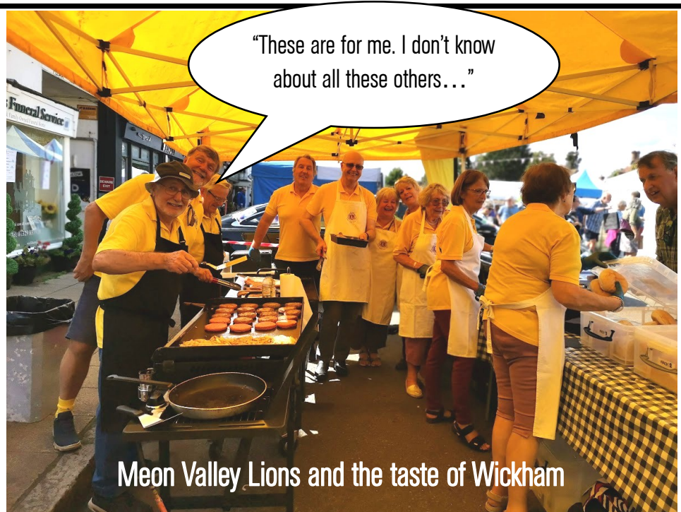
Meon Valley Lions and the taste of Wickham