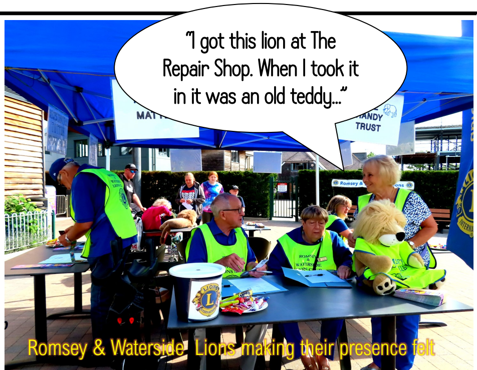
Romsey & Waterside Lions making their presence felt