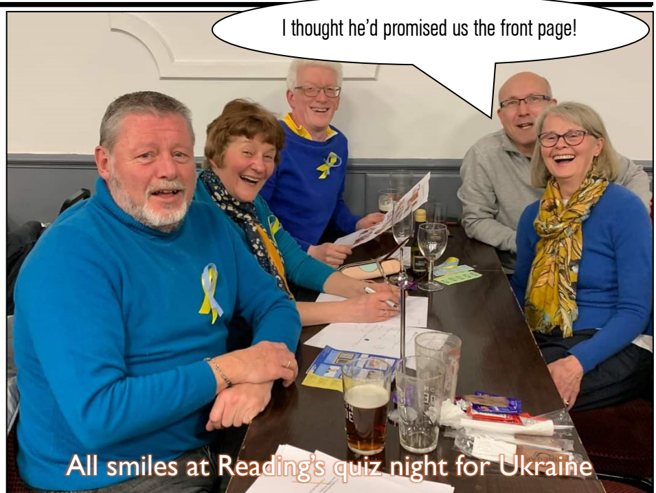
All smiles at Reading's quiz night for Ukraine

Please send all articles and pictures for publication in the