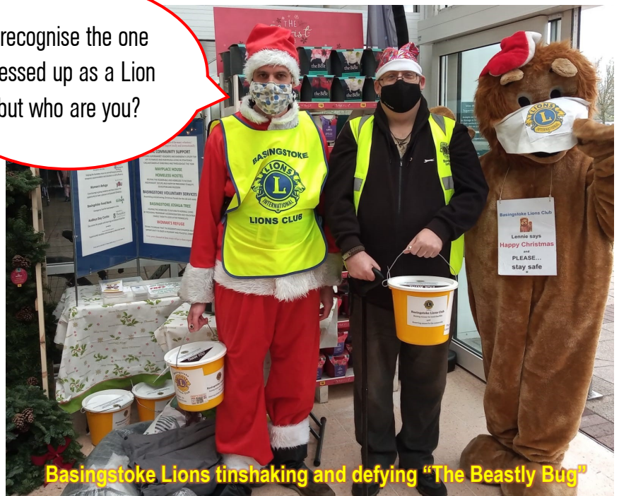
Basingstoke Lions tinshaking and defying "The Beastly Bug"

I recognise the one dressed up as a Lion but who are you?