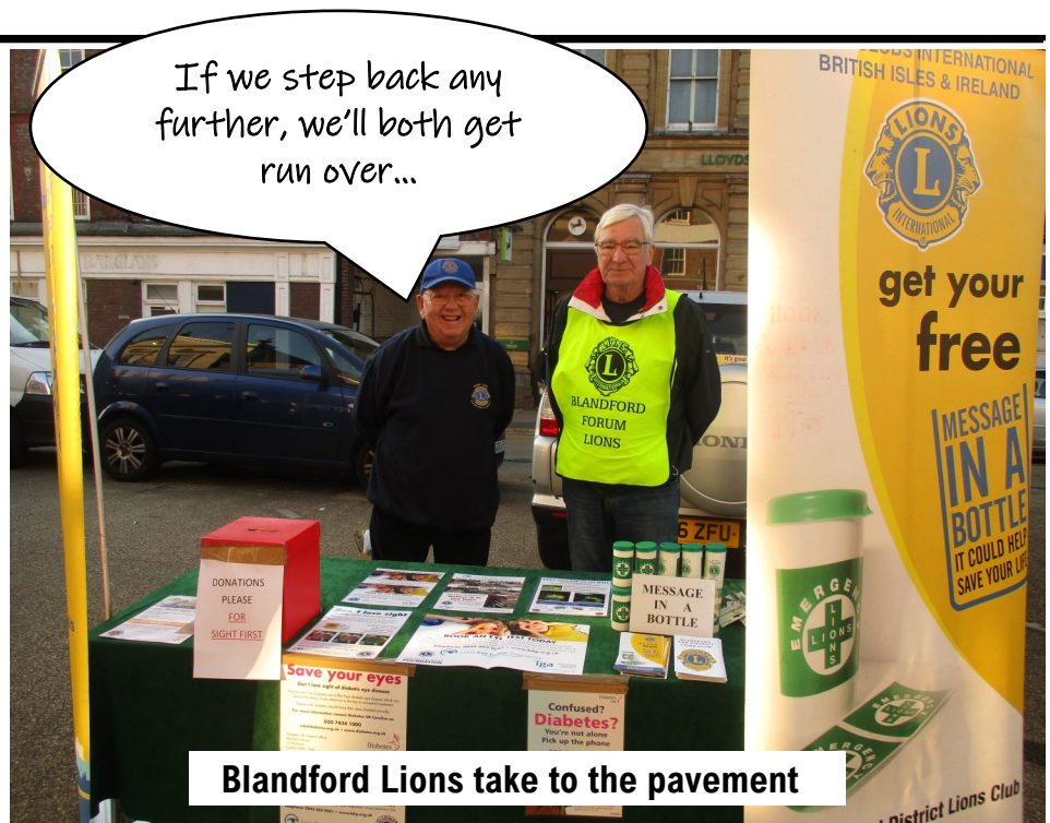
Blandford Lions take to the pavement

Please send all articles and pictures for publication in the