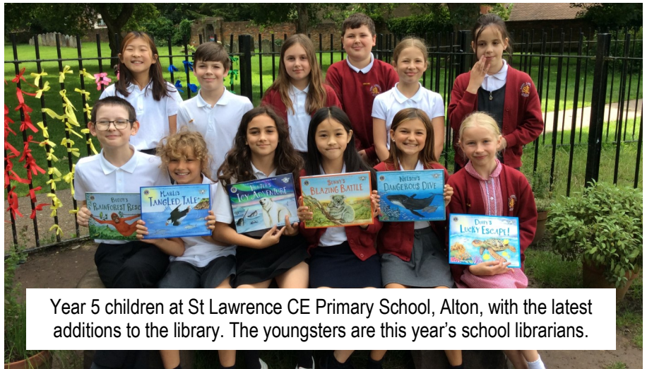
Year 5 children at St Lawrence CE Primary School, Alton, with the latest additions to the library. The youngsters are this year's school librarians.

The feedback from teachers has been very positive with the children learning about important global issues in a very accessible way..