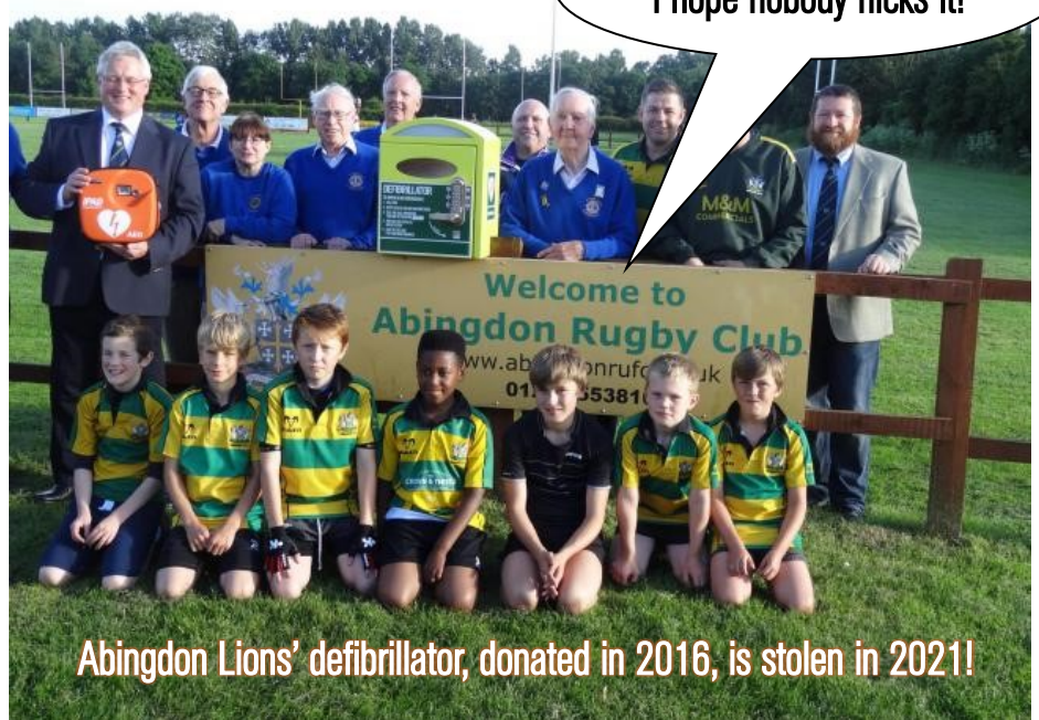
Abingdon Lions' defibrillator, donated in 2016, is stolen in 2021!

Please send all articles and pictures for publication in the