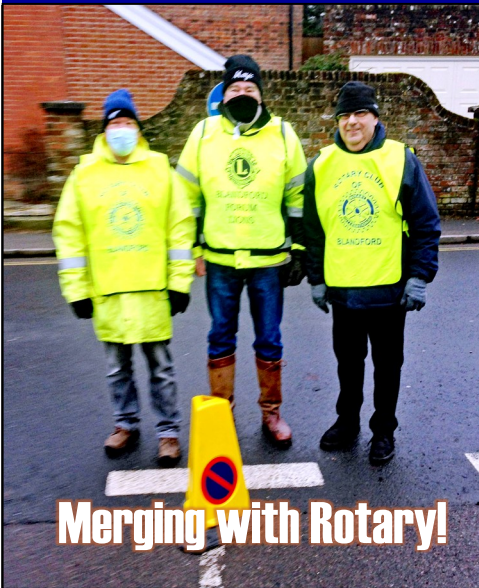
Merging with Rotary!

With a new day comes new strength and new thoughts. - Eleanor Roosevelt