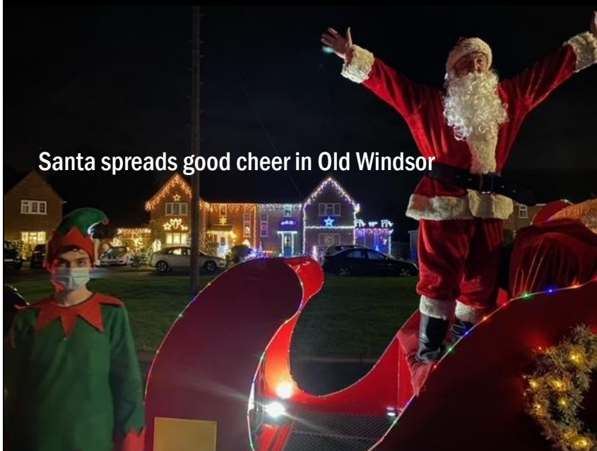
Santa spreads good cheer in Old Windsor

With foodstuffs, toys and monetary donations from local Lions and others, they were able to distribute 430 food hampers and 912 children's Christmas gifts, hopefully making this Christmas a little happier for many families.