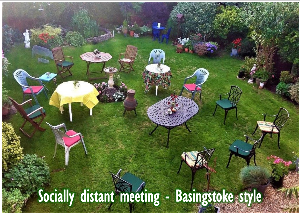
Socially distant meeting - Basingstoke style

Please send all articles and pictures for publication in the