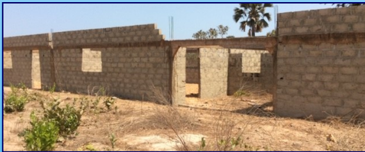
Above: The classrooms waiting for their roof and (below) the roof in place.