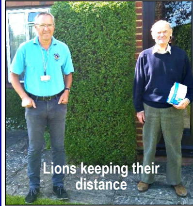
Lions keeping their distance