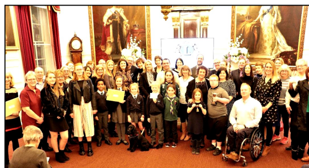
The beneficiaries in the spectacular setting of Windsor Guildhall.