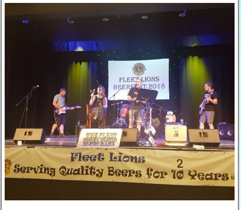
The Fleet Boozies band performs

Guests also enjoyed a hog roast and the Surrey Copper Distillery's gin and tonics were very popular. Entertainment was provided by the eclectic "Kindred Spirit" and the welcome return of the "Fleet Booze Hound Blues Band".