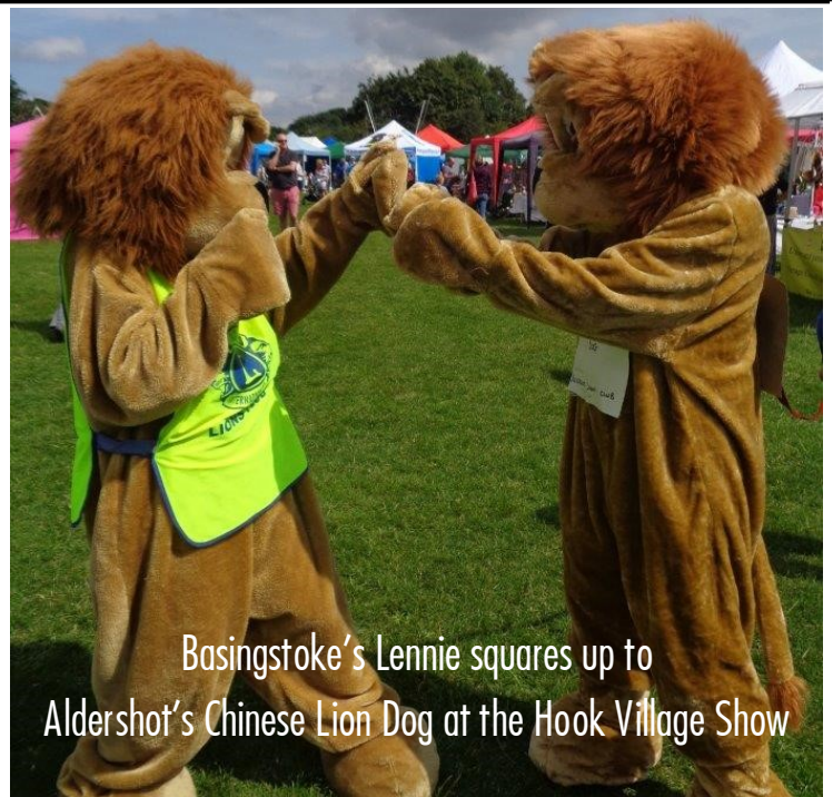
Basingstoke's Lennie squares up to Aldershot's Chinese Lion Dog at the Hook Village Show

Please send all articles and pictures for publication in the