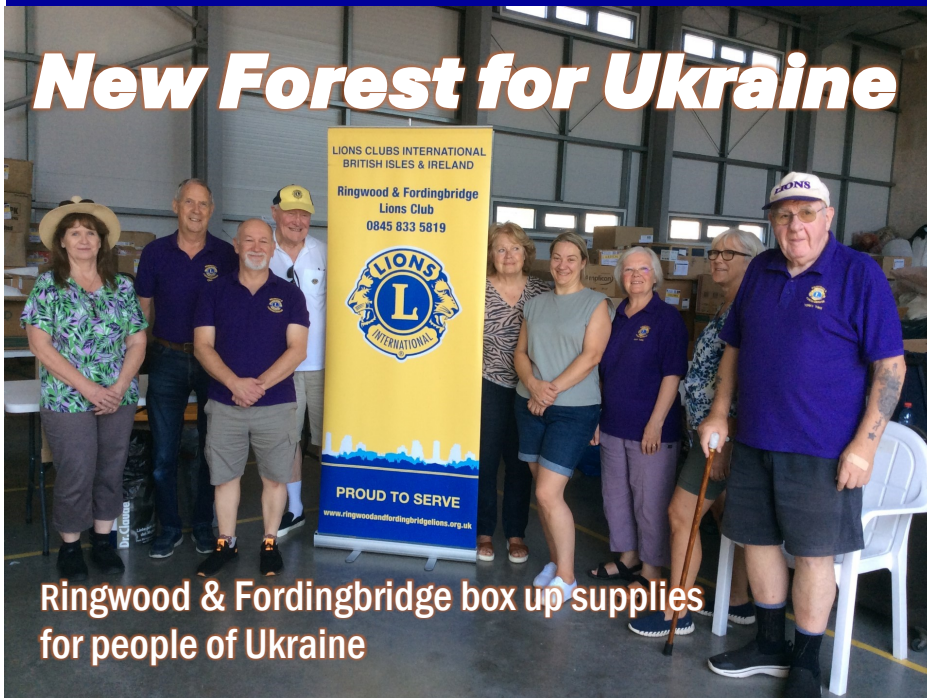
Ringwood & Fordingbridge box up supplies for people of Ukraine

On Saturday 9 September, Ringwood and Fordingbridge Lions travelled to Lymington to help New Forest for Ukraine pack much needed articles of donated clothing, toys, footwear, blankets and medical supplies into boxes destined for hospitals and aid centres in Ukraine and Poland.