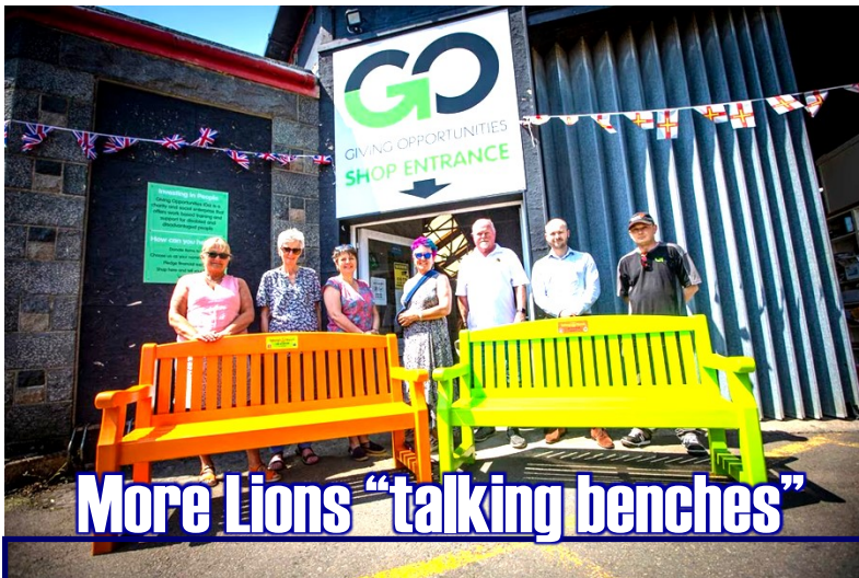
More Lions “talking benches”

Six new ‘talking benches’ will be sited in various locations around Guernsey ahead of the Island Games being held in the island later this month. The “talking benches” have been funded by the Lions Club of Guernsey and local builders’ merchants Norman Piette and built and painted by GO charity staff.